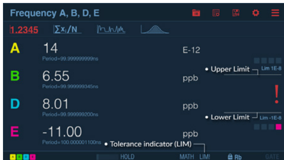
View 4 signals simultaneously on screen. 4 instruments in one!

Measured values are presented as both numerics and graphics. Graphical presentation of results (distribution, trends etc.) gives a better understanding of the nature of jitter. It also provides a much better view of changes vs time, e.g. drift. The same data set can be viewed in Numerical, Statistics, Distribution and Time-line views. It is very easy to capture and toggle between views of the same data set.