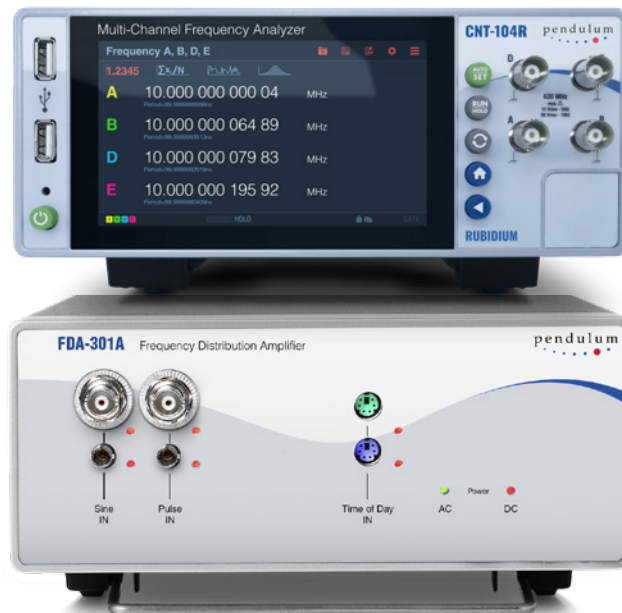
The FDA-301A distribution amplifier extends the number of 10 MHz outputs, up to 12

The CNT-104R comes as standard with one 10MHz reference output with ultimate frequency accuracy to 1 \times 10^{-12} , 24h average, using the optional integrated GNSS disciplining of the Rubidium clock. The addition of an FDA-301A Frequency Distribution Amplifier multiplies the number of outputs that can be distributed to 4, 8, or 12, depending on the number of rear-panel installed output modules (1, 2, or 3).