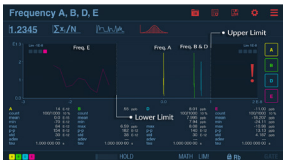
The Frequency distribution view reveals the spread (stability) of the oscillators

The limits can also be viewed in the frequency distribution display mode. The basic information is the same but this graph gives additional info.