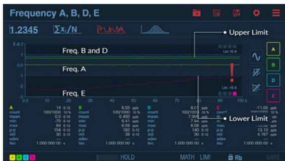
The time-line view reveals drift during the calibration

In the example below, three 10 MHz and one 5 MHz oscillators are tested in parallel, with tolerance limit \pm 0.1 Hz or 1 \times 10^{-8} . Oscillator A, B, D are inside limit range. Oscillator E is just outside range.