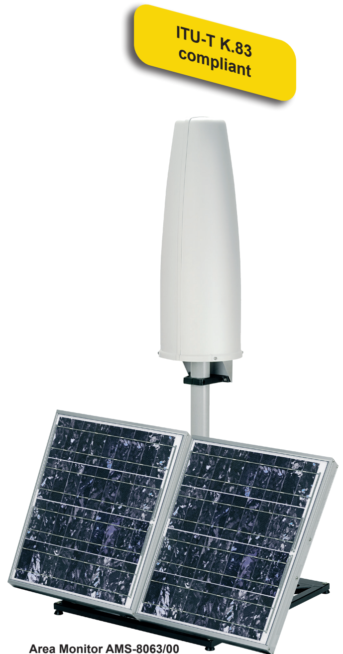
Area Monitor AMS-8063/00 with Solar Panel